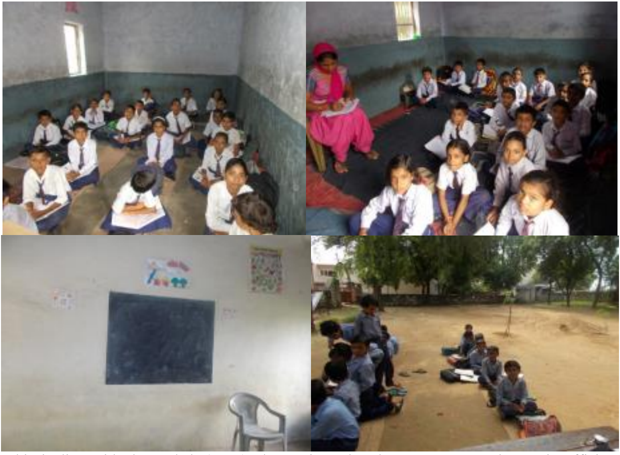
This in lieu with the Pathak (1999) observation when he says, "Large classes, insufficient infrastructural facilities and inefficient and/or inadequate teachers" (Pathak, 1999 p.14) are the

just a building but a combination of teachers, students and several other things. To learn and teach we need certain environment and facilities and that were completely missing. To breathe, we need fresh air so, in the same way to learn things we need proper infrastructure. In the Schools, students were sitting on the mats and there was no furniture. In rural government schools' buildings were poorly maintained. Small classrooms without proper ventilation, inadequate sanitation and drinking water facilities, no playground facilities are some other observations. In some schools due to shortage of rooms classes were held in open space. Most of the schools had poor library facility. There were only few books, and they were kept in almirahs.